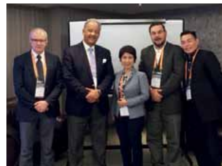
Members of the Operational Committee on Education.

working circumstances are far less attractive for psychiatrists as compared to other specialists contributing to a wave of transeuro-pean migration of medical doctors.