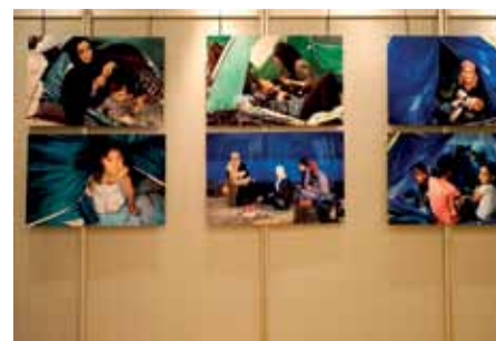
From the photographic exhibition of refugees (Dimitra Stasinopoulou).

The Section on Preventive Psychiatry of the WPA played a cardinal role in the congress.