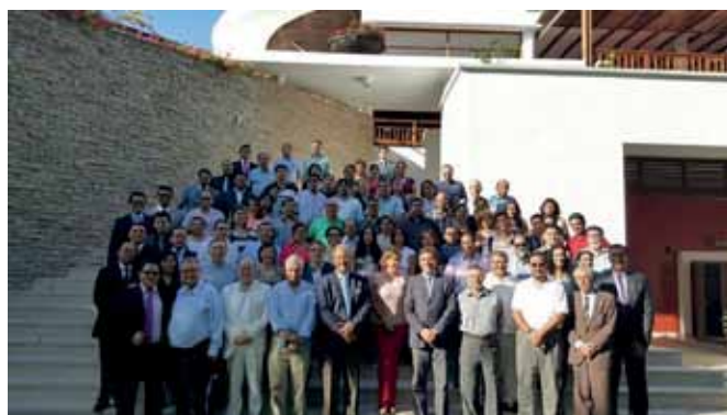
A psychiatrist meeting celebrated in Mompiche on October 29th, 2015.

On September 11 to 13 we supported a Neuro psychopharmacology Event in La Mirage - Cotacachi with special guests, on October 3 we had the Second Annual Sportive Meeting with our associates and their families for social integration, and on October 28 to 30 we had the II Meeting of