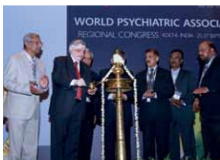
Hon Governor of Kerala Justice P Sathasivam inaugurating the WPA Regional Congress, Kochi, India on September 25, 2015. Also seen in the picture are Kuruvilla Thomas (Congress Secretary), Dinesh Bhugra (WPA President), Roy Abraham Kallivayalil (Secretary General, WPA), MC Nair (Chair, org committee) and TV Asokan (ZR Zone 16).

lectures by distinguished faculties. The academic package included thirty symposiums, ten workshops, seventy four free papers, sixty six posters. WPA Kochi Statement was drafted