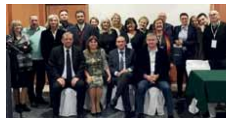
PABH General Assembly.

Our Symposium was co-organized by Department of Psychiatry, University Clinical Centre Sarajevo and supported by Medical Chamber of Sarajevo County who provided CME points for the Symposium. Course participants received specially designed