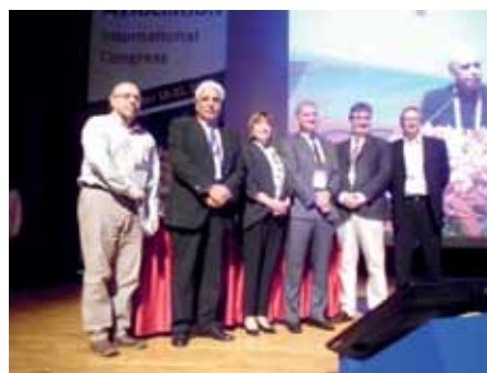
Attendees of WPA Intersectional Educational Programme session in Taiwan, November 2015.

Intersectional collaboration has emerged as an important theme in the Sections' work during this quarter. It is in this perspective that WPA organizes special sessions, seminars, and forums in different international and regional meetings highlighting the contributions of Sections in academic and educational areas. A special session focusing on intersectional educational programmes was organised at WPA International Conference,