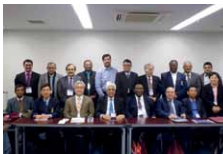
At the WPA Regional Congress, Osaka, June 2015.

Our Section has been very active and organized workshop/symposium in many international meetings. At the 5th World Congress of Asian Psychiatry (WCAP) which was co-sponsored by the WPA, the Section organized a workshop