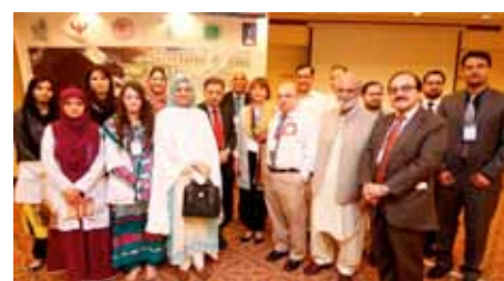
A group of delegates at the Inter Sectional Initiative in Peshawar.