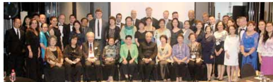
The Presidential Gala held at Sofitel Hotel Philippine Plaza Manila on February 4, 2016.

The theme “Psychiatry and Society in the 21st Century” highlighted the various growth areas in the science and art of psychiatry practice: neuroscience, psychopharmacology, brain imaging and advances in technology in the context of environmental and cultural challenges. The scientific program featured topics on Psychotherapy, e-Mental Health, Child and Adolescent Psychiatry, Intersectional Forum on Training Program for Young Psychiatrists, and on Women’s Mental Health, Updates on Psychotic Disorders, Biological Psychiatry,