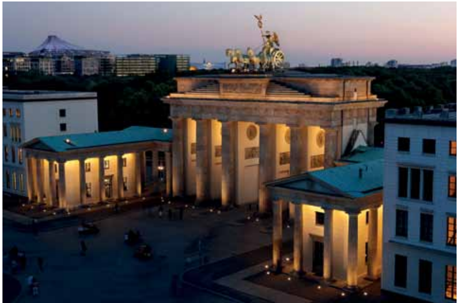
Berlin Brandenburg Gate.

You can look forward to an excellent scientific programme with renowned speakers